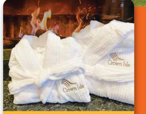
HOTEL BATH ROBES NOW AVAILABLE in the Golf Shop

With all of the exciting things happening around Crown Isle, unfortunately, we received some bad news this week. Due to COVID and the current international travel restrictions, the Mackenzie Tour has made the tough decision to move the Q-School south of the border this year. They will run 8-10 events for Canadians only, in Canada, and approximately the same number of events in the US for all Makenzie Tour members. The good news is that we have secured the Q-School for four years starting the spring of 2022.